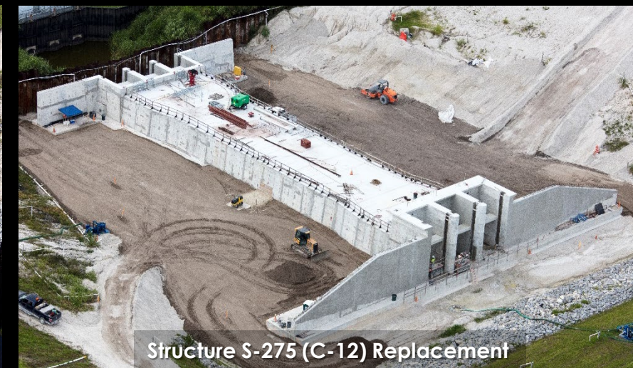
Structure S-275 (C-12) Replacement