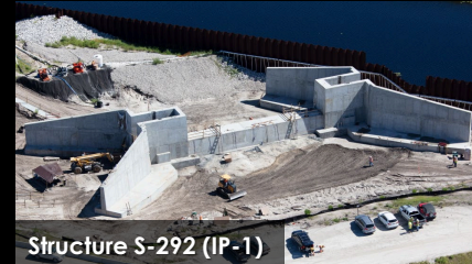
Structure S-292 (IP-1)