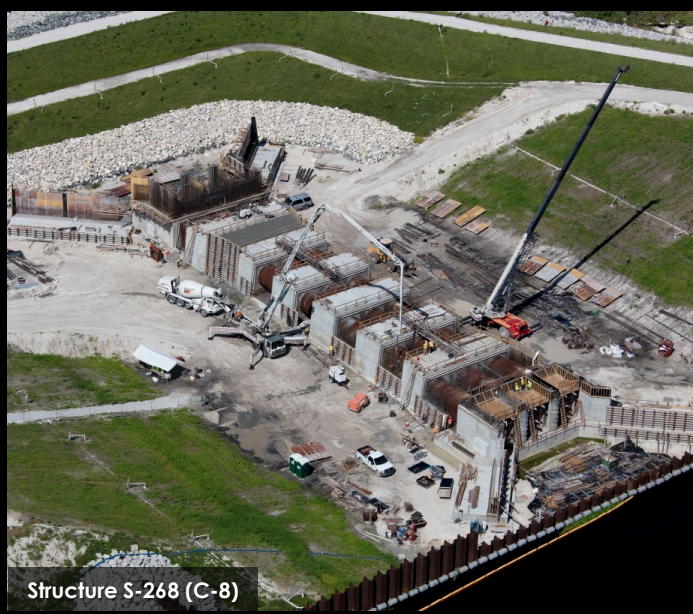
Structure S-268 (C-8)