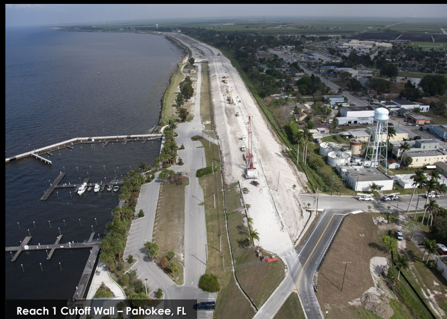
Reach 1 Cutoff Wall – Pahokee, FL

(MATOC = Multiple Award Task Order Contract)