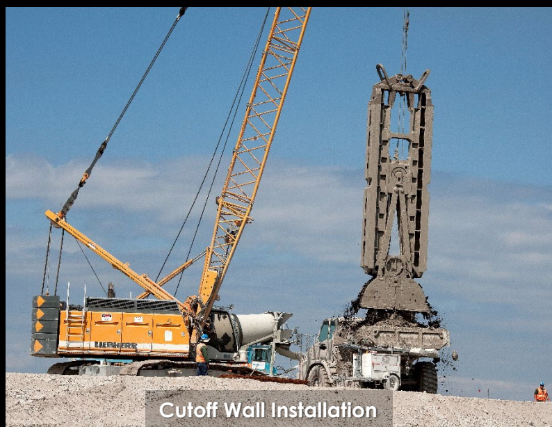
Cutoff Wall Installation