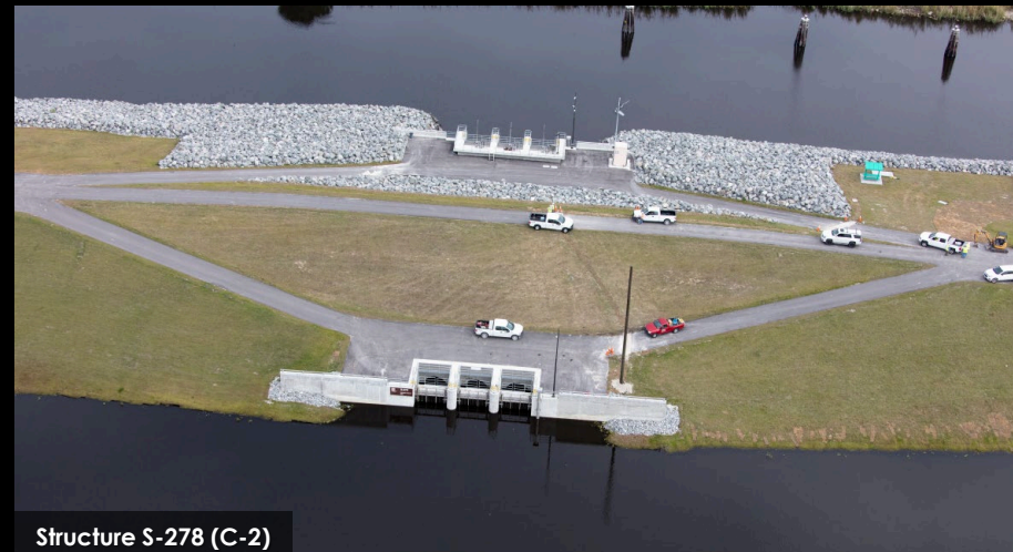
Structure S-278 (C-2)