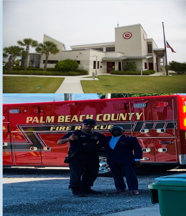
Station 74-South Bay

https://www.pbso.org/our-communities/d11/