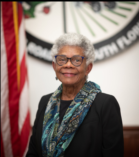
Commissioner Esther Berry