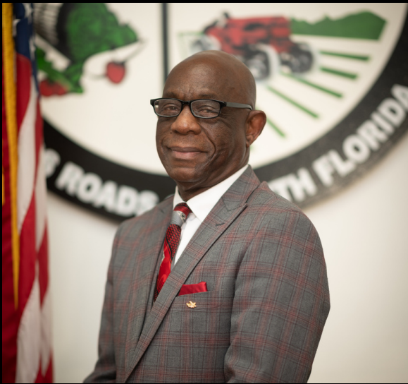
Mayor Joe Kyles